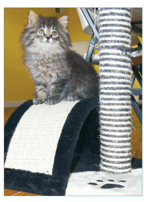
Ash contemplates his new scratching post